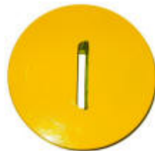
9 .475" x 3.25"