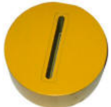
7 3.75" x .150"