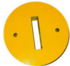
10 4" x .75"