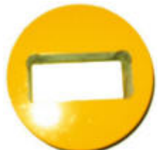
16 1.50" x 1.75"