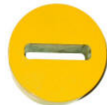
14 .750" x 3.20"