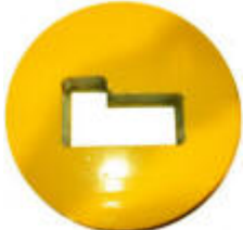
1 1.5" x 2.11" x 4"