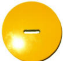
17 1.5" x .250"