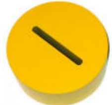
5 3.5" x 3"