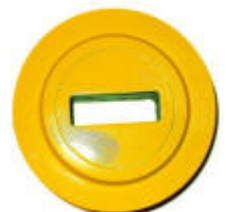
20 3" x 1"