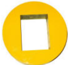
11 4.50" x 3.50"