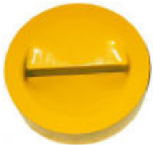
6 5.8" x .50"