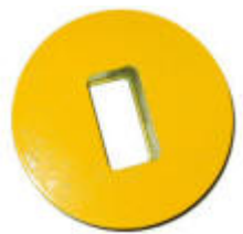
12 4.20" x 1.0"