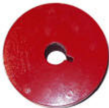
22 1.0, 0.365" x .200"