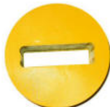
18 1.0" x 4.15"