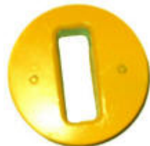
13 3.125" x 1.75"