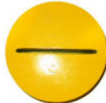
4 3.4" x .25"