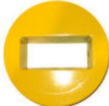
3 2" x 5"