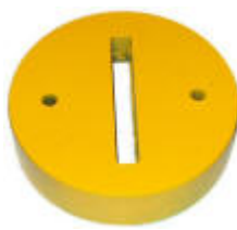
8 5.4" x .625"