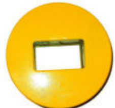
15 2.75" x 1.50"