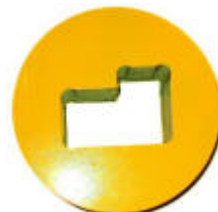
19 1.5" x 2.50" x 3"