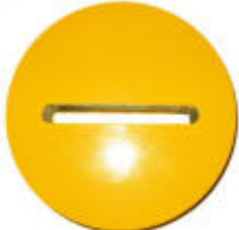
2 .50" x 5.25"